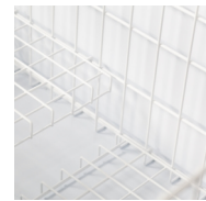
Adjustable false base